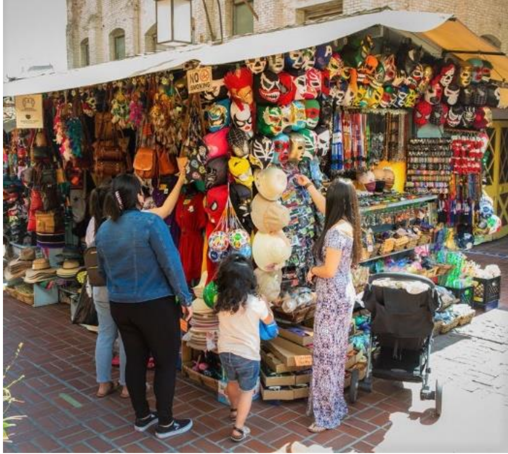
Example of Puesto on Olvera Street