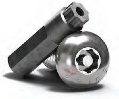
Vandal Proof Bolt