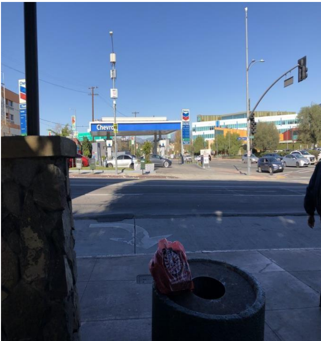
North from Cesar Chavez