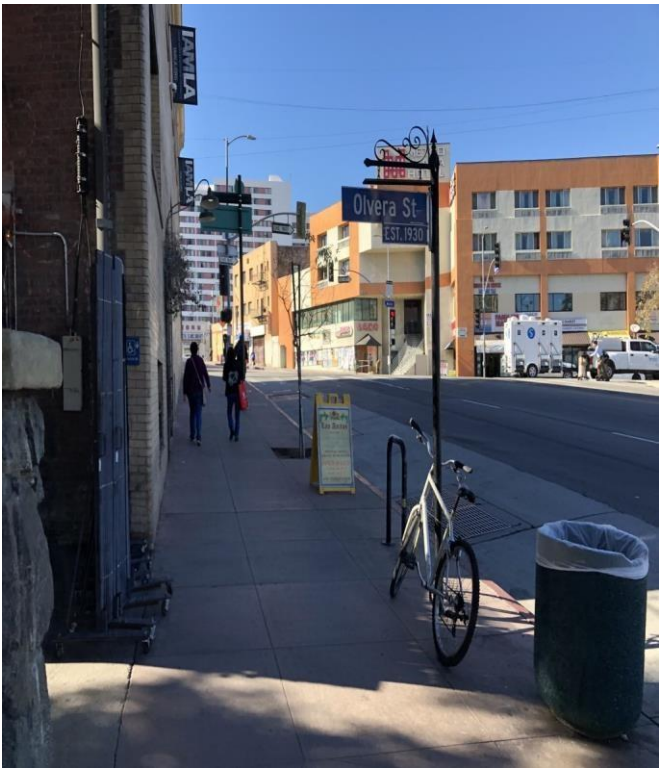
Subject - Entrance from Cesar Chavez Facing West