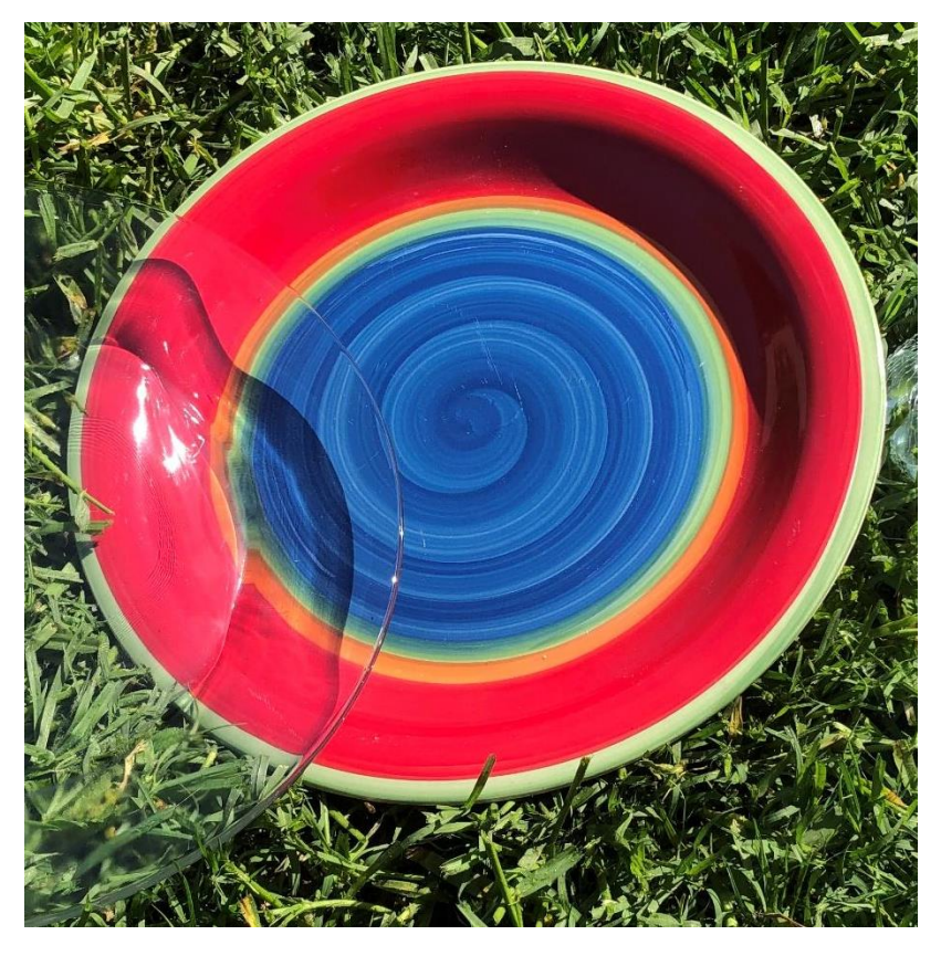
Hint: This project is a great opportunity to recycle any plates you may have that are chipped!

Step Three: Add glass pebbles or rocks or a combination of both to your plate.