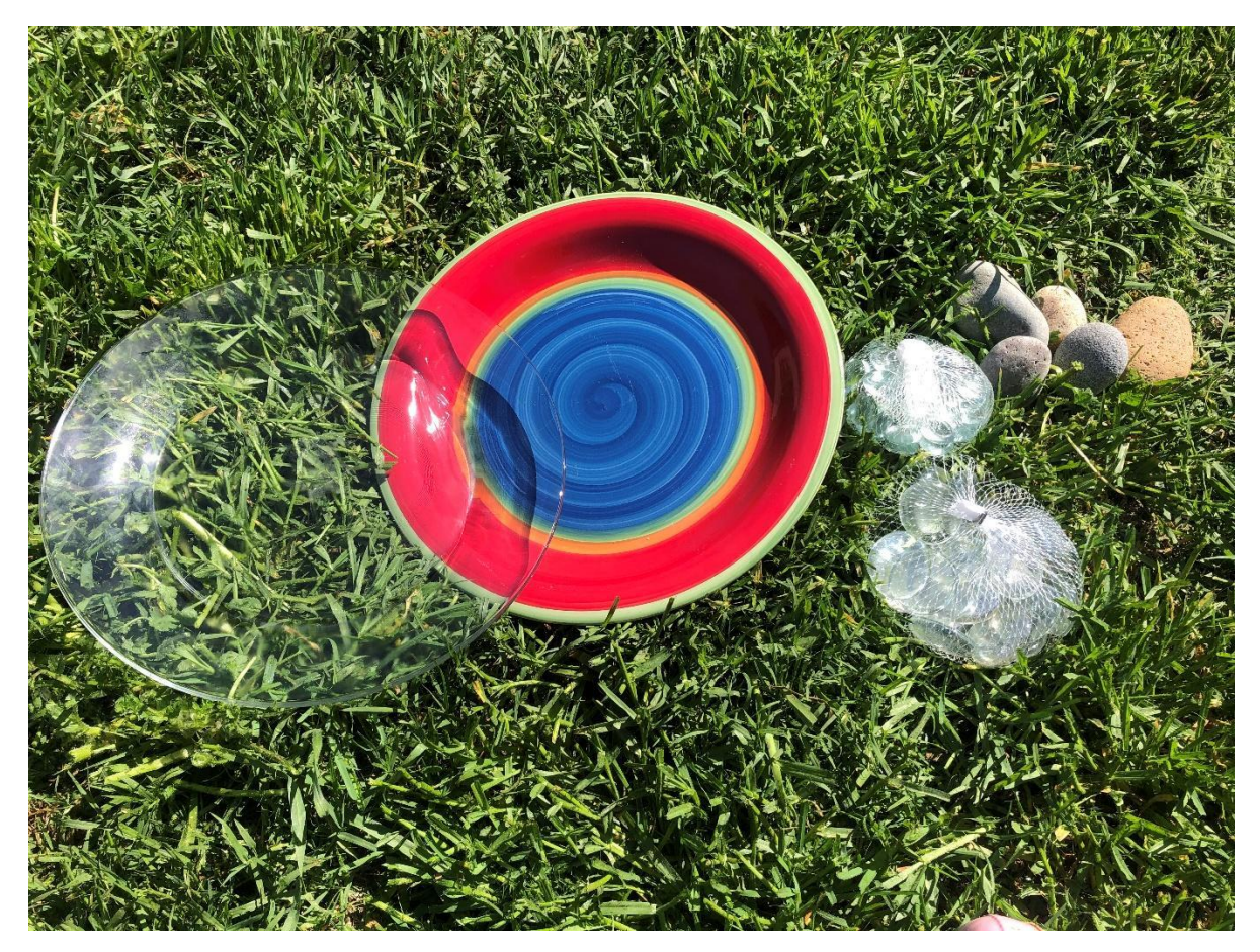
Hint: For the step-by-step images we will be making (2) different bee baths.

Step One: Collect all your materials on a flat surface.