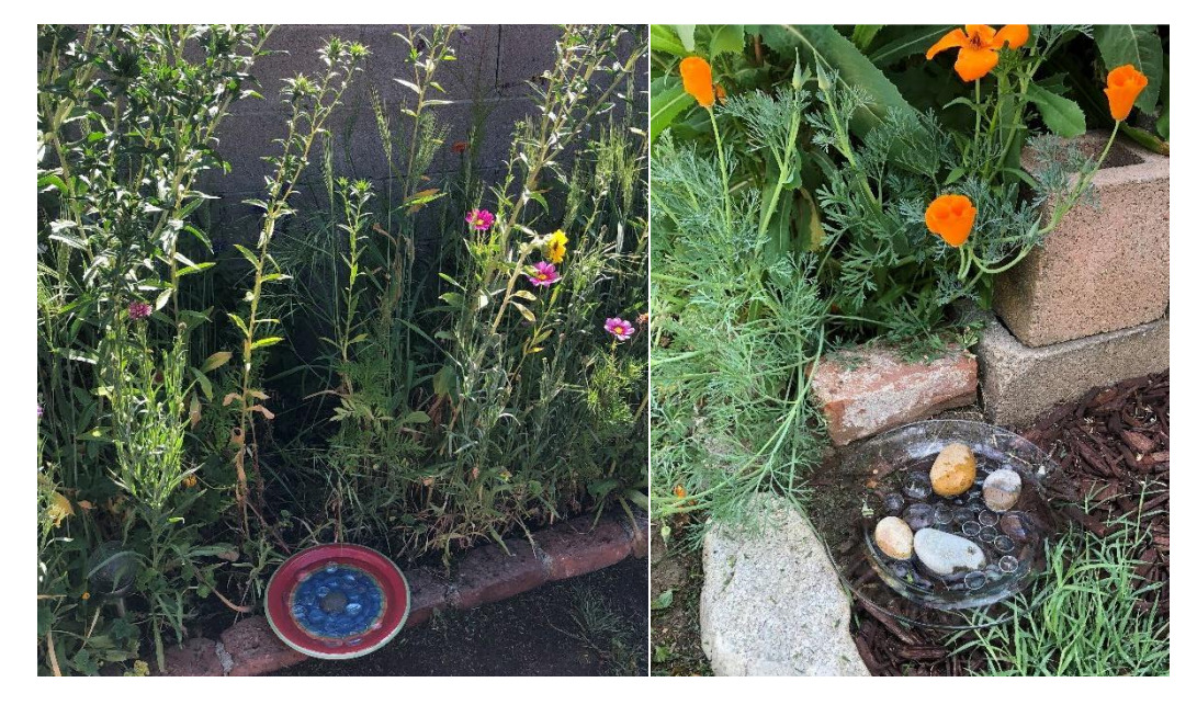
Hint: You can also place them on your patio or balcony to allow bees flying by to take a break!

Step Five: Place your bee bath in a shady area.